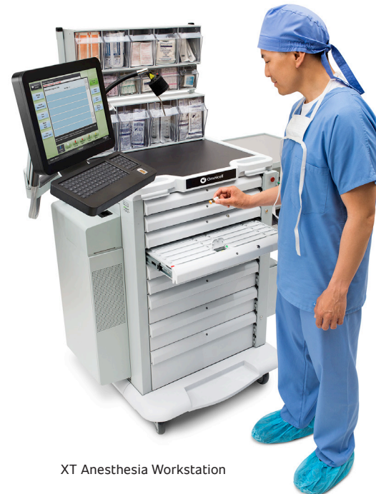
XT Anesthesia Workstation