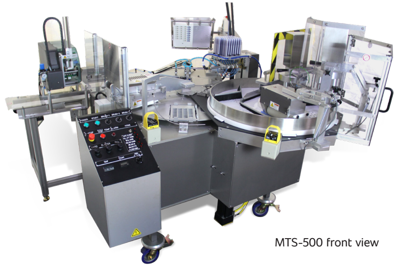
MTS-500 front view