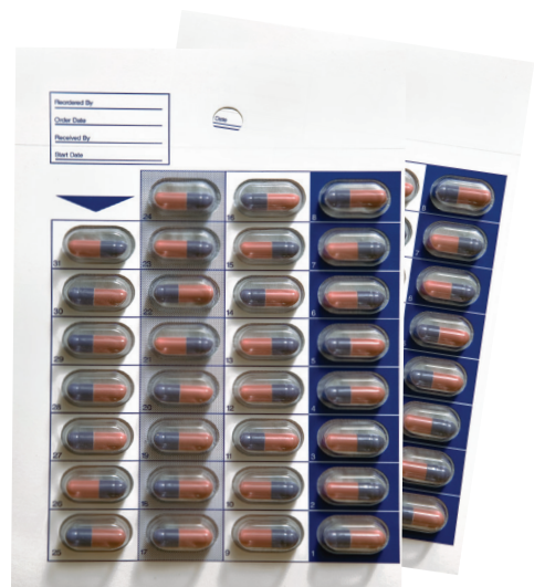
31-day Dose (Item# 300-58) (31 large blisters - Item #200-34)