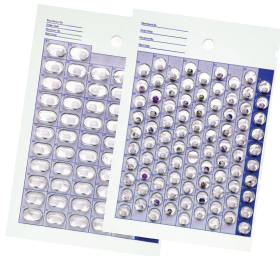
62-day Dose (Item# 300-64) (62 blisters - Item #200-23)